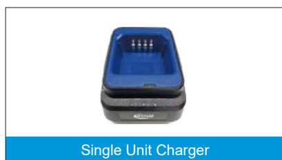
Single Unit Charger