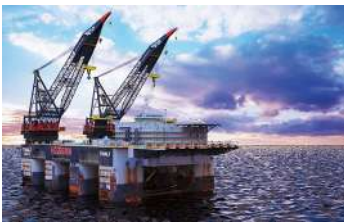
Oil Exploration Industry