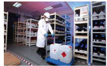
Storage of Hazardous Chemicals