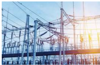
Power Generating Companies